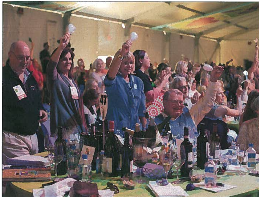
In a show of solidarity, bidders cheer one another on and congratulate the winners.