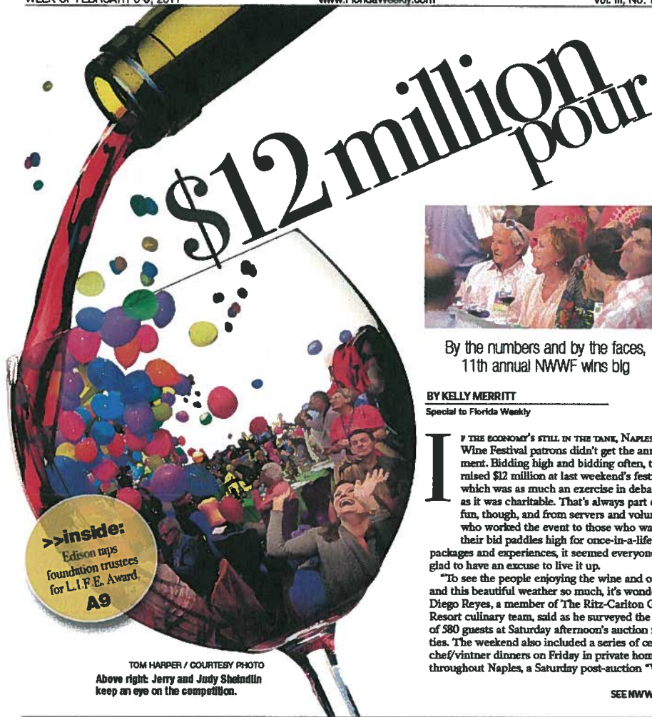
Above right: Jerry and Judy Sheindlin keep an eye on the competition.